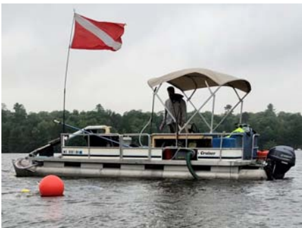
Boat used for diving

As always, I enjoyed meeting and talking to so many of the Yellow Birch property owners this past summer. Some of you I've met previously and others for the first time. And in 2019 four new property owners moved onto Yellow Birch Lake.