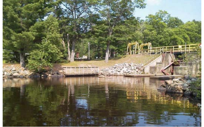
Burnt Rollways Dam

All materials removed from the river were deposited into a pond located behind the WVIC house at the dam/hoist. Once dredging is completed the pond will be filled in and the site will be leveled and landscaped.