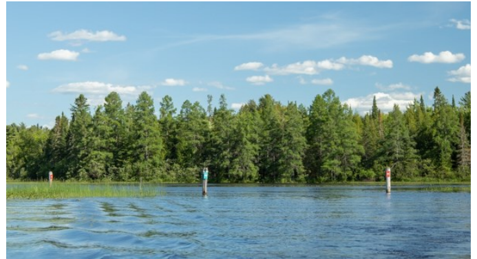
Channel between Cranberry Lake and the dam

This project should make boating between the Eagle River and Three Lakes Chains easier. If you have any questions about the project, please contact WVIC at 715-848-2976, or email staff@wvic.com .